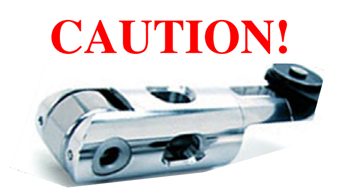
The use of lifters that are heavily lightened should not be used in Dart Blocks. The lightening holes will cause lifter oil to leak into the valley instead of oiling the pushrod, rocker arm and valvespring.

We recommend a .020"deep x .080"radius wide groove from the pushrod feed hole to the oil band / machined feed hole in your solid lifters ( Front hole only as shown in Figure 2 above) depending on your tooling & method. You can also do this with a cutoff wheel or a dremel. This allows you to use the restrictor provisions provided in your Dart block to tune oil volume to the lifter oil galley. This allows you to control the oil going to the pushrods, rocker arms and valve springs.